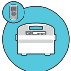
Multi-Function Power Supply and Remote Control *

Triple-action brushing delivers extra-effective scrubbing and cleaning. The active brush spins at 2x the speed of the robot to scrub fine pool surface debris, leaving your pool water clean, clear, and healthy.