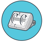
Triple-Action Brushing *

Dolphin's swivel cable eliminate tangled cables forever! As your Dolphin moves around the pool, the swivel ensures that the cable stays free and clear, allowing for complete pool coverage.