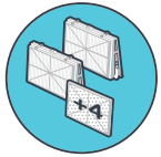
Ultra-fine Cartridge - with additional choice of net filters

Advanced scanning software and gyroscopic navigation system ensure floor, walls and waterline are fully covered using the most efficient route. The Dolphin automatically navigates around obstacles and quickly returns to its cleaning pattern.