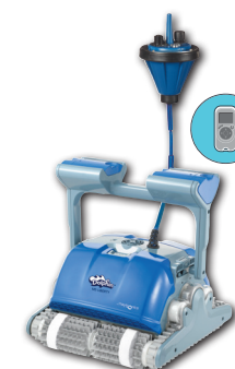
Supreme M5 Liberty