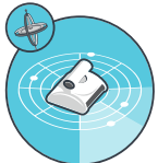
CleverClean™ Coverage + Gyro - precise navigation system *

Preset your Dolphin operation at a touch! Easily set cleaning programs, cycle time, weekly schedule, delay operation, and filter bag status, all via the touch-button power supply unit / remote control.